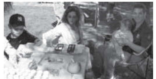
One participant enjoys a face painting

ports for children with disabilities. The response to the survey, in addition to interviews and best-practice information gathering initiatives, confirmed all edu-