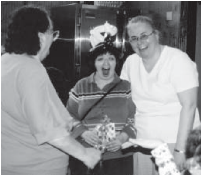
Smiles all around!

Outreach employees also assist people in the development, refinement and maintenance of life skills such as cooking, laundry, budgeting, and reading. Community gatherings are always a favorite activity and take place in a variety of forms including parties and dances. The Family Resources Program is very active in planning day long excursions with destinations including but not limited to Howe Caverns, Foxwoods, Mohegan Sun, Sturbridge Village, Lake George, Boston Harbor, and Hildene to tour the home and gardens of Robert Todd Lincoln in Manchester Vermont.