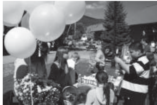
Children enjoying the BFAIR activities at the Northern Berkshire United Way Children's Fair

In early 2004, agency representatives attended a meeting facilitated by the Northern Berkshire Community Coalition focusing on residential services for children in crisis. State agencies as well as private organizations were present. It was made clear throughout the meeting that there is a critical service need for children with cognitive and/or emotional disabilities. It was identified that a high number of children have been placed out of their