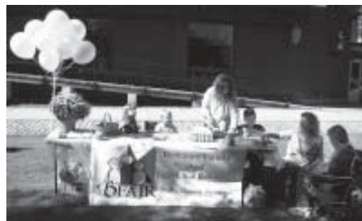
The BFAIR table launching Children and Adolescent Services

Armed with this information, in late summer 2004 BFAIR launched the Children and Adolescent Services Program. This program is designed to serve